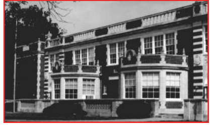
The "Gage School" portion of our facility—where Academy classes are held.

Topeka Civic Theatre & Academy is the oldest continuously operating community dinner theatre in the country. Formed in 1936, we have had a long, rich history of producing award-winning theatre for the people of northeast Kansas. We have continually worked to reach out to the children in this area through various programs, including theatre classes. In 1999, we made "Academy" a permanent part of our name when we moved into the Gage School facility at 8th & Oakley. This move gave us the space and resources